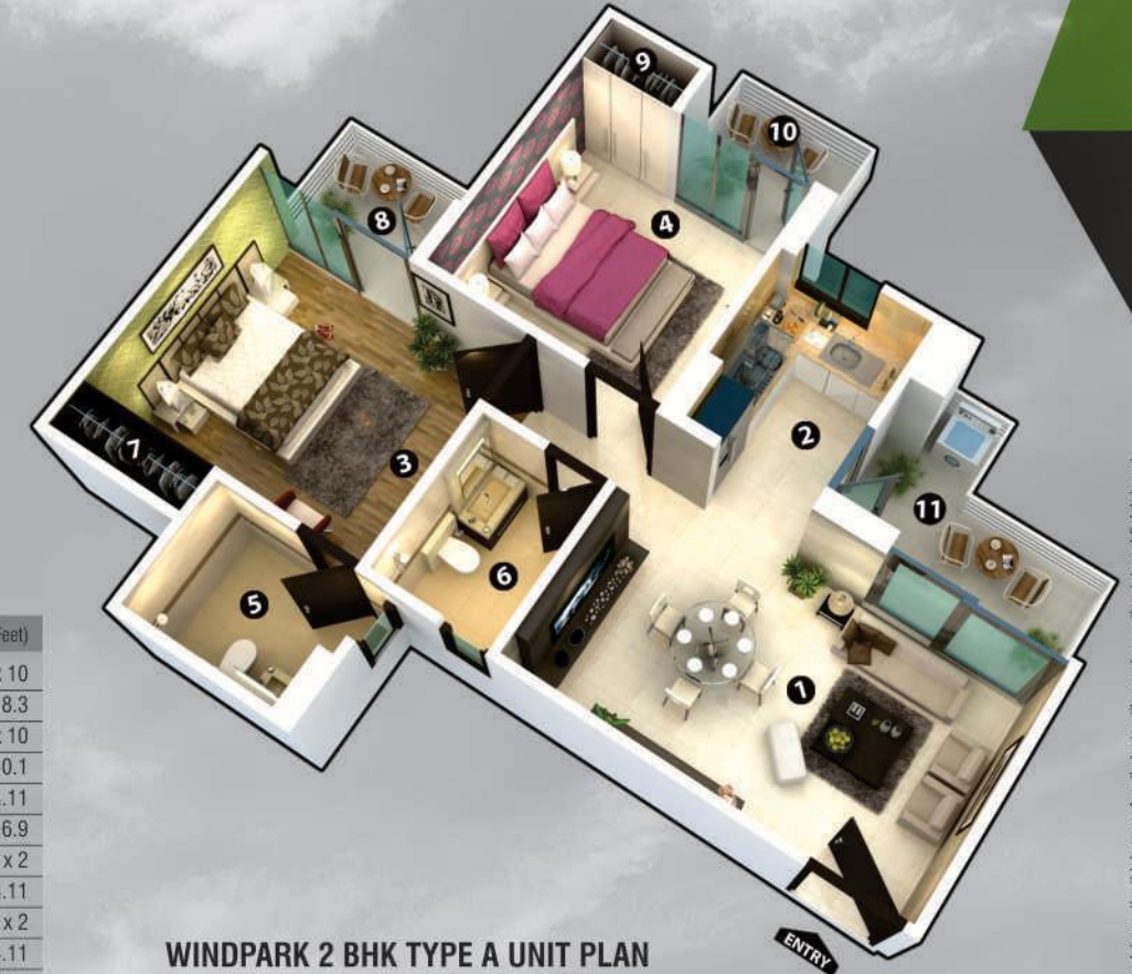
WINDPARK 2 BHK TYPE A UNIT PLAN SUPER AREA: AROUND 997 SQ. FT

Disclaimer: the thickness of wall, plaster, tiles and any other internal finish is not considered in the sizes mentioned.