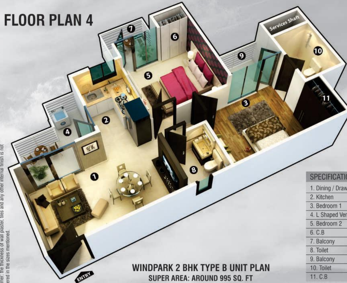
WINDPARK 2 BHK TYPE B UNIT PLAN SUPER AREA: AROUND 995 SQ. FT

Disclaimer: the thickness of wall, plaster, tiles and any other internal finish is not considered in the sizes mentioned.